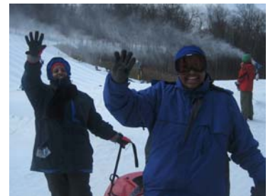
Waves and smiles after a run down the slopes

Liberty Mountain Resort 78 Country Club Trail Carroll Valley, PA 17320 Tel: 717-642-8282