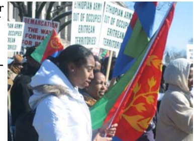
Youth contribute their voice to the call for peace

spected," and "Eritrea Wants Peace." In addition, youth