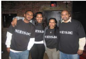
"Eritrean Youth on the Rise!"

A brand new year, a brand new focus! NUEYS-DC launched its 2006 plan of action for the youth through a fun filled evening of music, food and entertainment at Mirror's Night Club on New York Ave. in Washington, DC