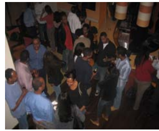
ERI-Youth mix and mingle

to be in DC . . . NUEYS-DC's ERI Youth Mix 'n Mingle! If you've missed out, fret no more. We do it every month!