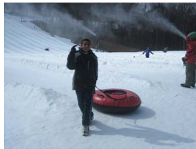
A happy face in the snow

Upon arrival, the youth spent the day snow-tubing or sledging down steep hills in big rubber tubes!