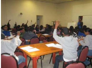
A full room participates in class

January 21, 2006 marked the inaugural class of NUEYS-DC's Eritrean Language School (ELS) in Washington, DC. This school's mission is to strengthen the youth's knowledge of the major languages spoken in Eritrea. ELS right now features both beginner Tigrinya and Arabic language instruction to Eritreans of all ages, ranging from 7-48, and has plans to grow to include more languages in the future.