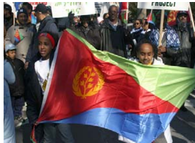
Youth marching for peace

NUEYS-DC organized Eritrean youth in the DC area to create banners for the march, bearing slogans including "Demarcation Now!," "The Rule of Law Must Be Re-