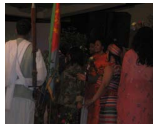
Youth performing during the opening ceremony

participated in the celebration during the opening performance in which the older generation of women symbolically passed on the torch of community building to the next generation through the giving of flowers.