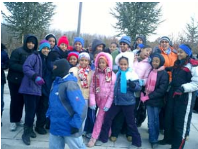
Group shot before we hit the slopes

Bright and early on Sunday, February 26th, 2006 a busload of 50 Eritrean youth and parents from the Washington, DC area headed up to the Liberty