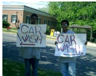
Look at these convincing faces