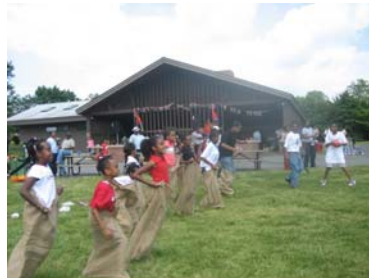
Youth potato sack racing

Activities ranging from soccer and basketball games to tug-of-war, paired with endless supplies of hot-dogs, hamburgers and stebhi, kept the youth running all day. The ever present green-red-blue and yellow flag of Eritrea seen from all corners