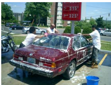
Getting that car squeaky clean!

On May 06, 2006 NUEYS-DC held its first car wash of others this year to help