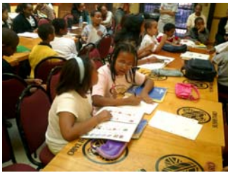
Students prepare presentations

Saturday, May 20, 2006, NUEYS-DC held the last class of its first session of Eritrean Language School, which taught Arabic and Tigrinya language classes to Eritrean youth from the Washington, DC area.