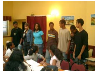
Students giving presentations

NUEYS-DC will begin the second session of the Eritrean Language School in early