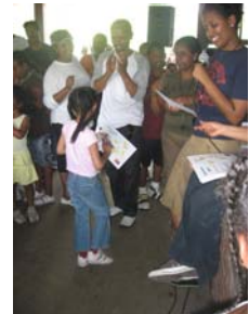
Graduation Ceremony, Independence Day Picnic May 26, 2007, Washington, DC